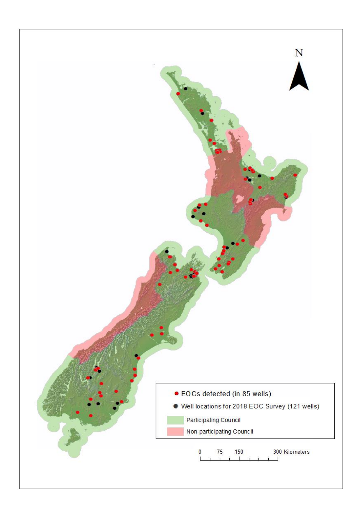
Figure 2: Regions and sampling locations for the 2018 survey of EOCs in groundwater.